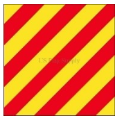
Code flag 'Y' – PFD's to be worn.